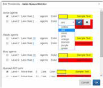
Thresholds can be quickly and easily set.

To further increase a supervisor's ability to monitor performance, the SL2100 Contact Center allows them to set threshold levels for the specific values in the display. they can define two threshold levels and select the background color to be used in the table cell or block when threshold levels are reached.